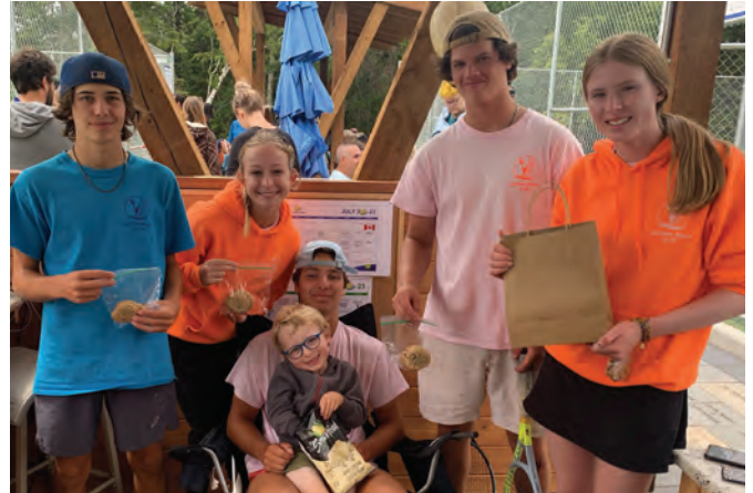
Enjoying some bakery products