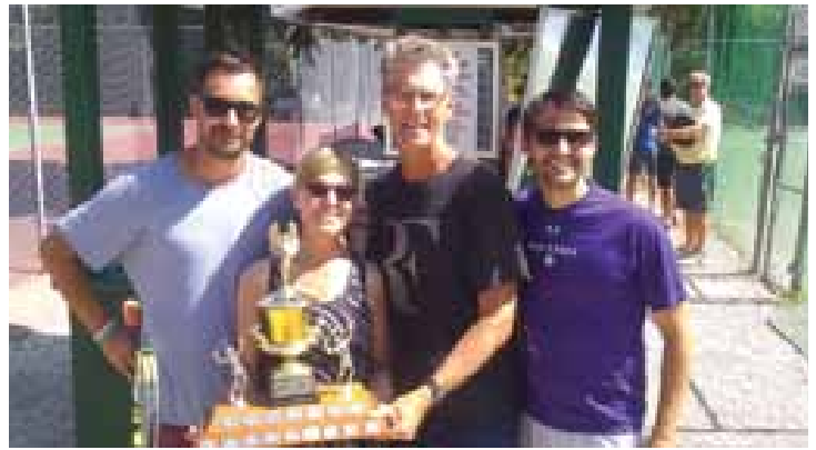
Winners Overall - Les Deux Andreux