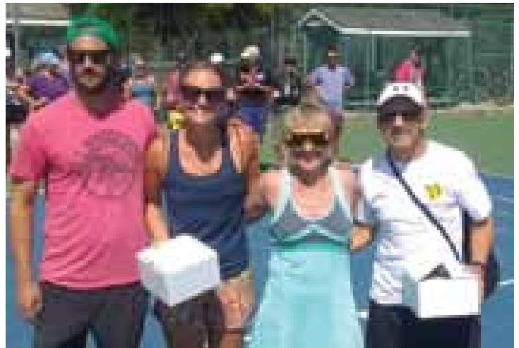
Winner Wimbledon Not My Fault