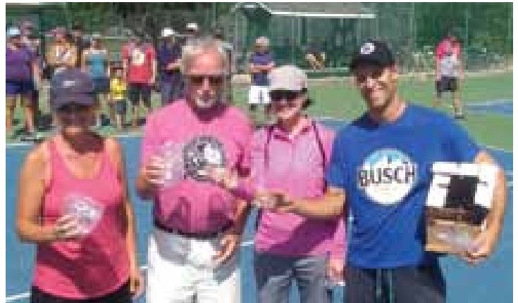
Runner Up Wimbledon One For Fun